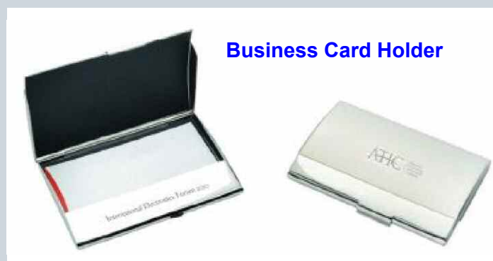
Business Card Holder

We are happy to discuss tailor made packages to suit individual budgets contact us for further details